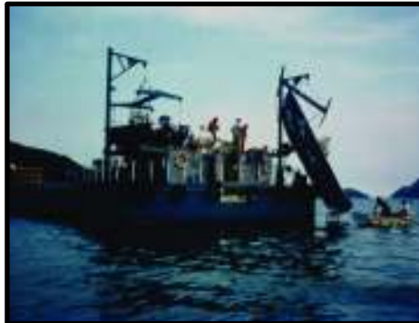
Left: The Barge used in Project Pearl's delivery of one million bibles into China in 1981.

After many delays the team are finally ready to go when a typhoon is reported.